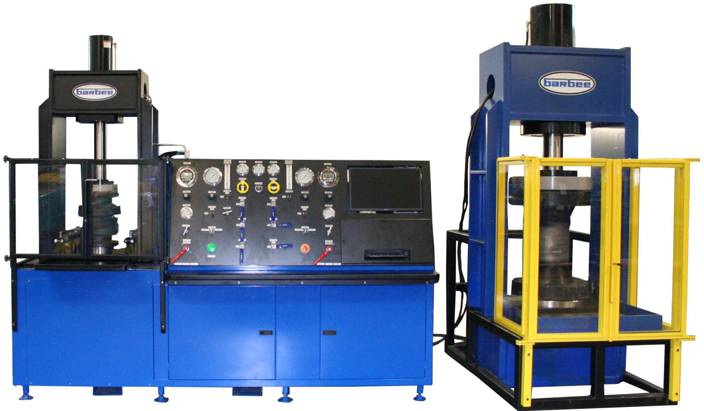
LVR MODEL SHOWN WITH A DUAL STATION: 100 TON CLAMPING FIXTURE ON THE CABINET AND A 400 TON FREE-STANDING FIXTURE FOR LARGER VALVES. DUAL INDEPENDENT HYDRAULIC AND HYDROSTATIC TEST SYSTEM.